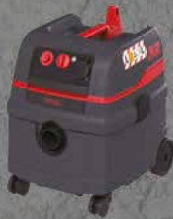
Vacuum Cleaner DS25L 305-00371-000-001