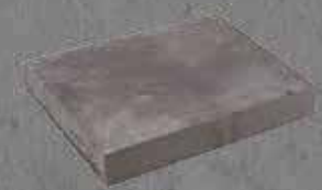
Sharpening plate 305-00372-000-001