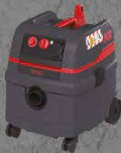
Vacuum Cleaner DS25L 305-00371-000-001