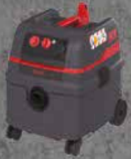
Related Product: Vacuum Cleaner DS25L 305-00371-000-001