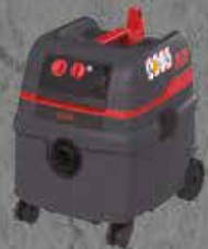
Related Product: Vacuum Cleaner DS25L 305-00371-000-001