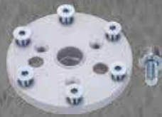
HV Pattern Flush Cutting Kit- 1" arbor Longyear 6-bolt (3 1/2" (88,9mm) bolt hole circle) & 3 bolt combined 0299-0213-0000-002