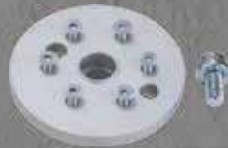
HY Pattern Flush Cutting Kit- 1" arbor 6-bolt (60mm bolt hole circle) 0299-0213-0000-001