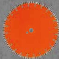
Ø 355 Diamond Saw Blade(Ø25.4) 305-00036-000-063