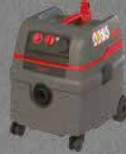
Related Product: Vacuum Cleaner DS25L 305-00371-000-001