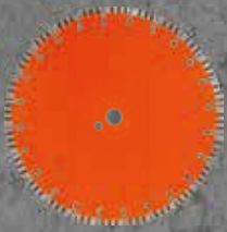
Ø 405 Diamond Saw Blade(Ø25,4) 305-00036-000-063